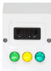
WALL MOUNTABLE CONTROL